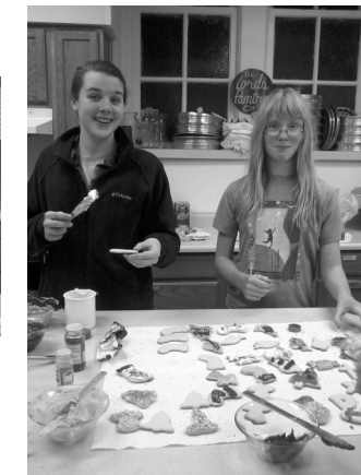
Youth Group cookie baking!!!