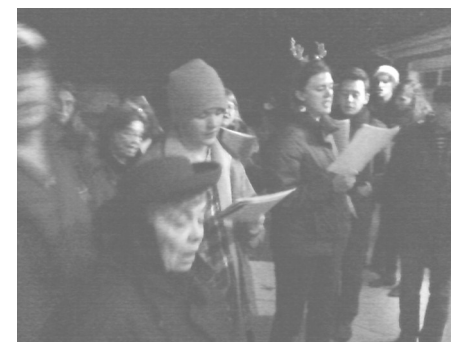
Christmas Caroling Party!!